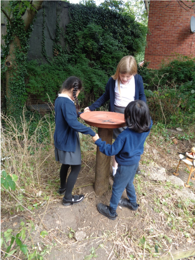
“Stamping down dance!”