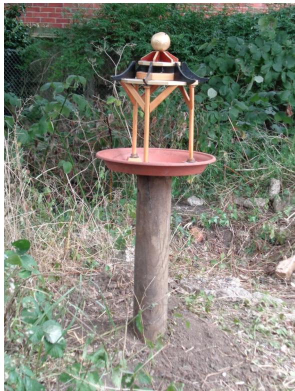
The finished article ready to be stocked up