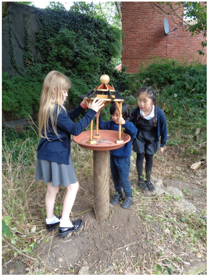
Or “temple” is positioned